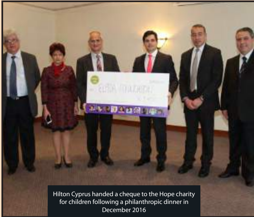
Hilton Cyprus handed a cheque to the Hope charity for children following a philanthropic dinner in December 2016