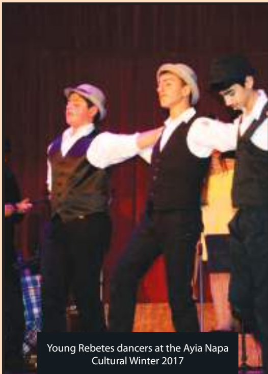
Young Rebetes dancers at the Ayia Napa Cultural Winter 2017