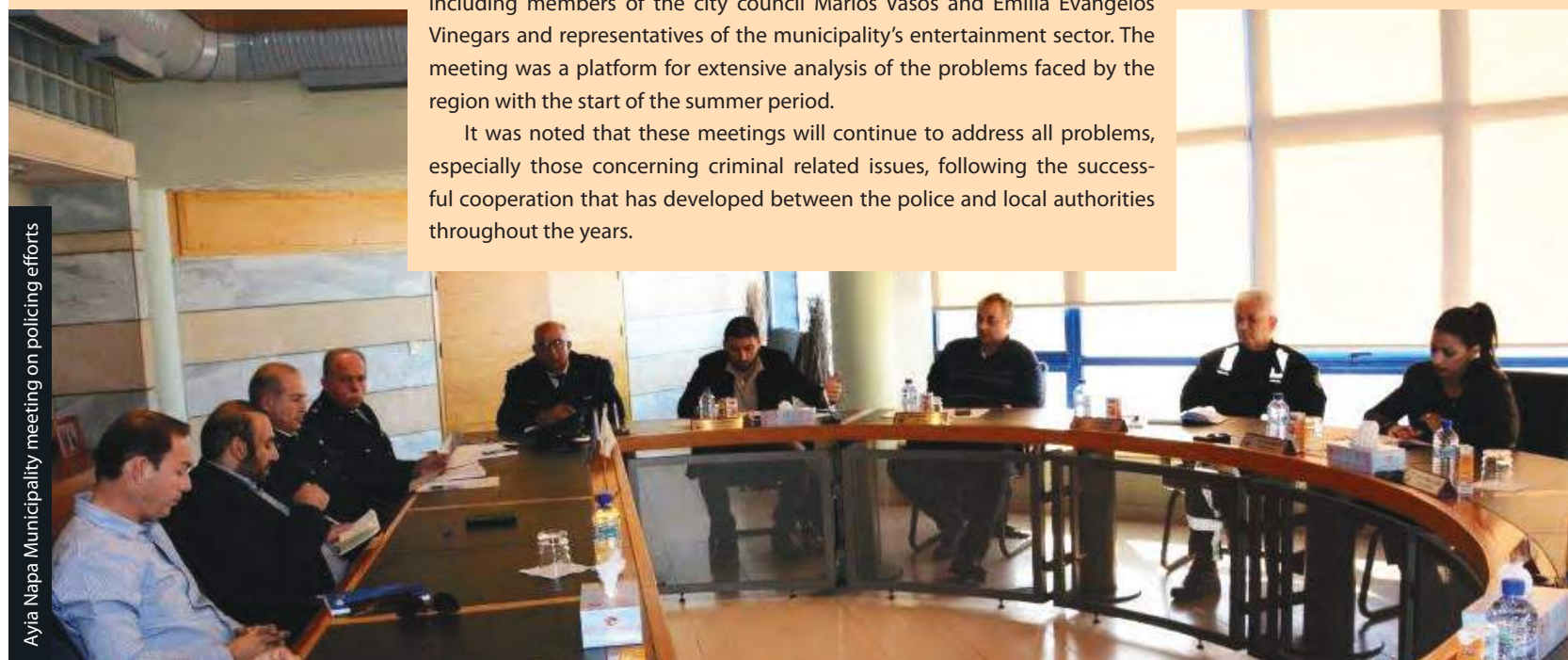
Ayia Napa Municipality meeting on policing efforts

It was noted that these meetings will continue to address all problems, especially those concerning criminal related issues, following the successful cooperation that has developed between the police and local authorities throughout the years.