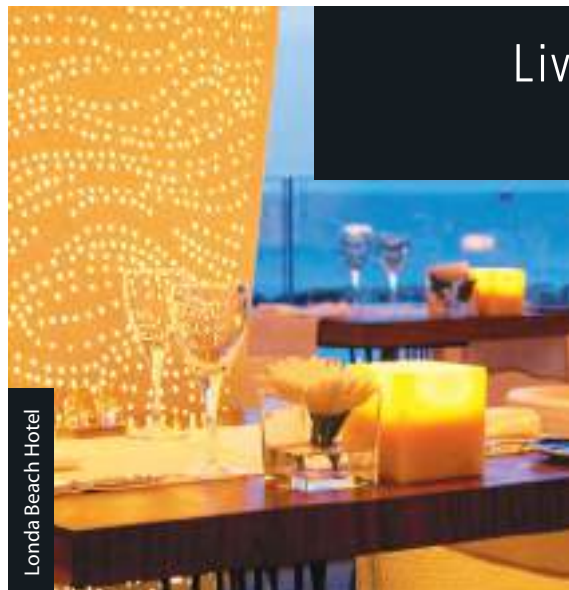
Londa Beach Hotel

In January 28, Londa Beach hotel in Limassol welcomed guitar virtuoso Artur Akhmetov along with Leonid Nesterov Trio, who performed a night of Jazz music at the hotel's Caprice Restaurant.