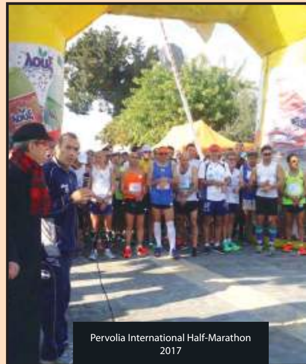
Pervolia International Half-Marathon 2017