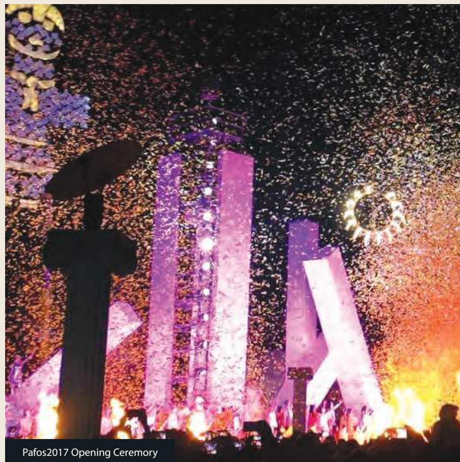
Pafos2017 Opening Ceremony

In addition, the cultural events are promoted in such a way that every citizen and traveller will feel that they also participate. The strong bonds made with other European countries have been further enhanced and strengthened, with the result being that the region is, and will continue to be, widely