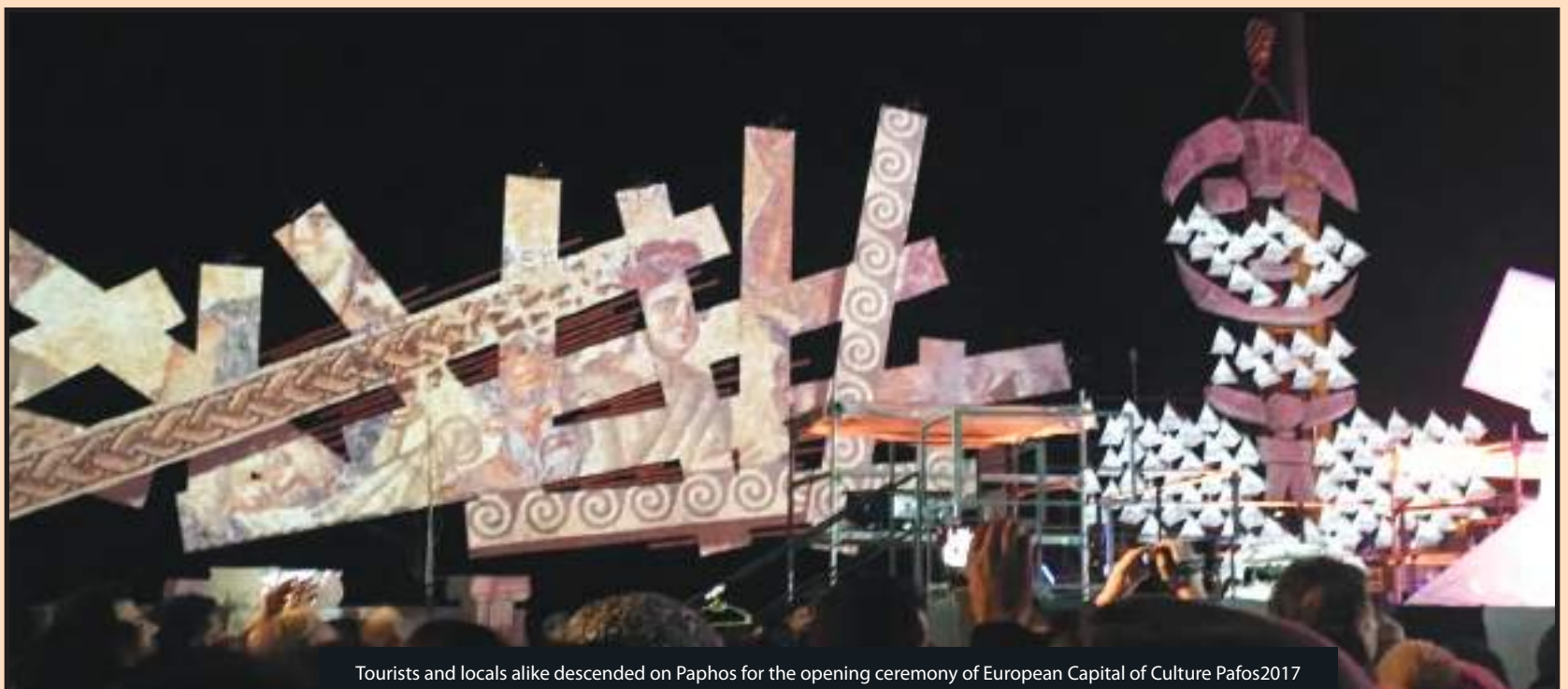
Tourists and locals alike descended on Paphos for the opening ceremony of European Capital of Culture Pafos2017